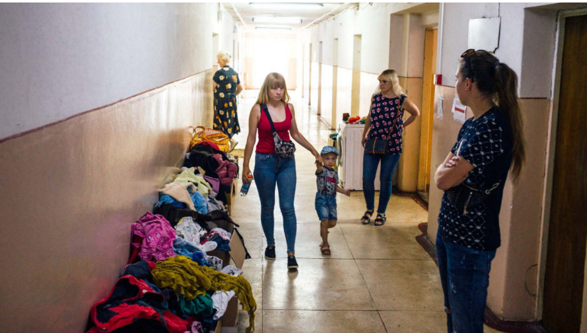
Uzghorod University, where the Carpathian Foundation welcomes displaced persons, women and children in particular.