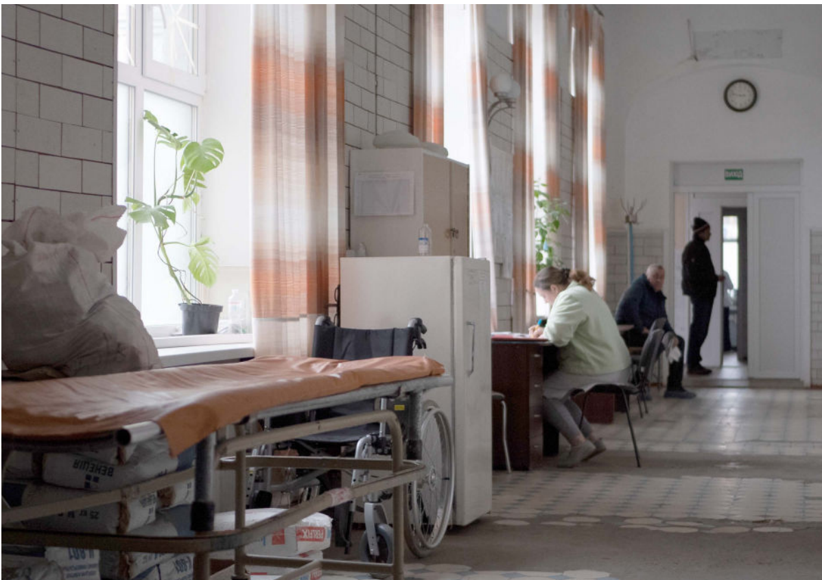
Nonprofit CAM-Z install generators in hospitals, which are vital in the event of power outages.

Because lighting and heating are needed – especially in winter, as well as shelter and food, Fondation de France supports a number of initiatives to equip welcome centers and hospitals with generators. Électriciens sans frontières (Electricians Without Borders) and CAM-Z install generators in collective establishments like hospitals, where power outages endanger the lives of patients in intensive care. For its part, Angel of Salvation provides heating to accommodation centers for refugees who come from the front line or occupied areas.