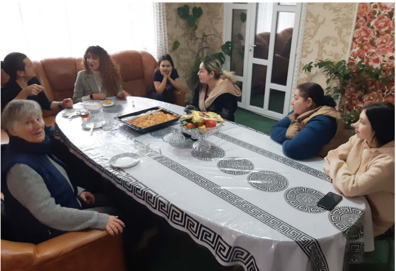
In Moldova, the Roma Awareness Foundation caters for basic necessities such as accommodation and food for Roma refugees from Ukraine.

In Romania, Concordia , a nonprofit specialized in social care for children, provides comprehensive assistance to Ukrainian refugee families, from temporary accommodation to psychological and administrative support. It also organizes leisure and educational activities for the youngest, to help them hold the trauma of war at bay. Over the last six months, support has been provided to more than 700 people, mostly women and children.