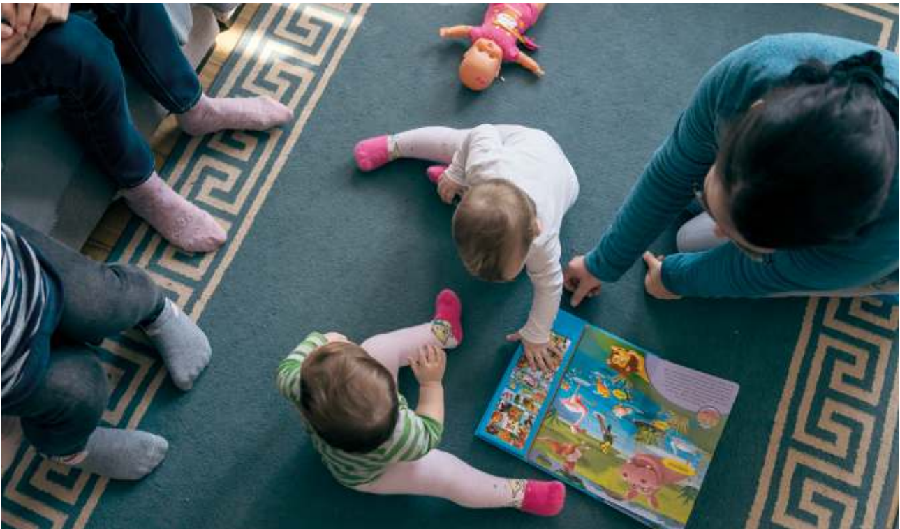
The Hope and Homes center hosts refugee children in Romania.

Finally, in Poland , the Saint-Nicholas Foundation , a Polish charity that has been working for children for around 20 years, has launched a call for projects from Polish civil society to help Ukrainian refugee children by providing them with activities (sports or artistic workshops, outings, games, etc.), psychological support, language courses, school supplies and support, etc. Ten of their projects have received support from Fondation de France.