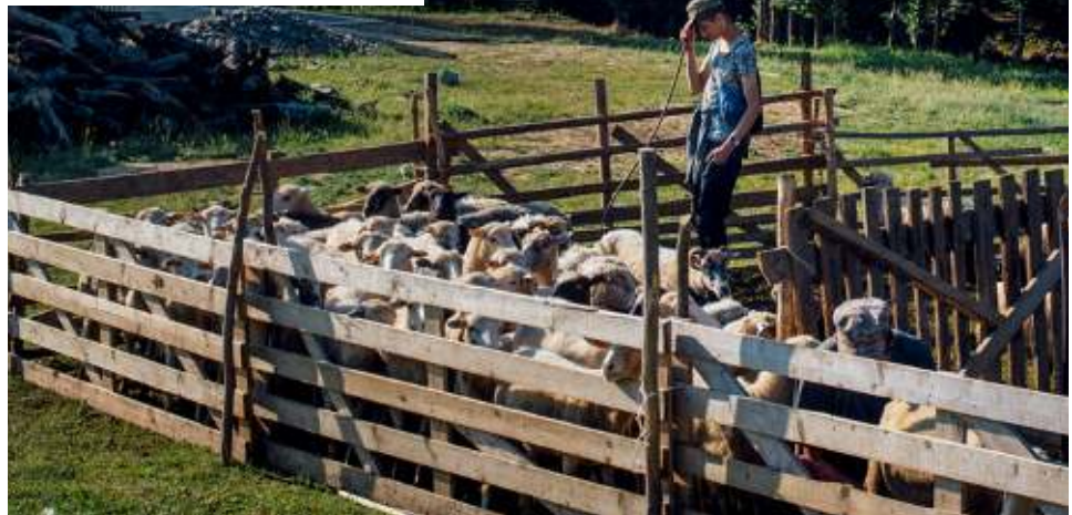
The craftwork and agricultural cooperative Longo Mai, South West of Ukraine, welcomes displaced people.