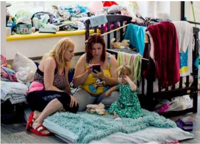
A reception center for displaced people in Lviv.